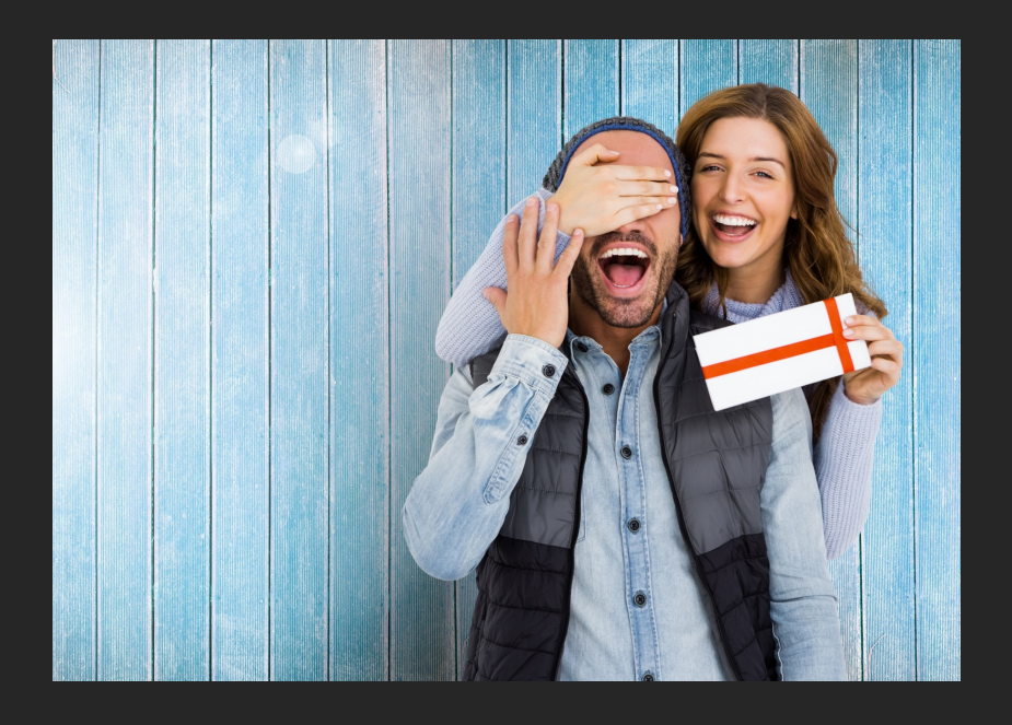
Gifting is super important to Below The Belt

Gifts are a great introduction to the brand, either for yourself or someone else and they introduces the concept of 'Fresh and Dry Balls' to the more conservative customer (we know there are some) allowing them to try the product alongside our great Deo's & Shower Gels – an all over experience