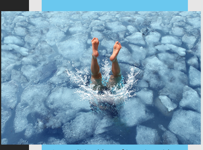
A tantalising blast of icy mint with a citrus hint for an extra tingle down there